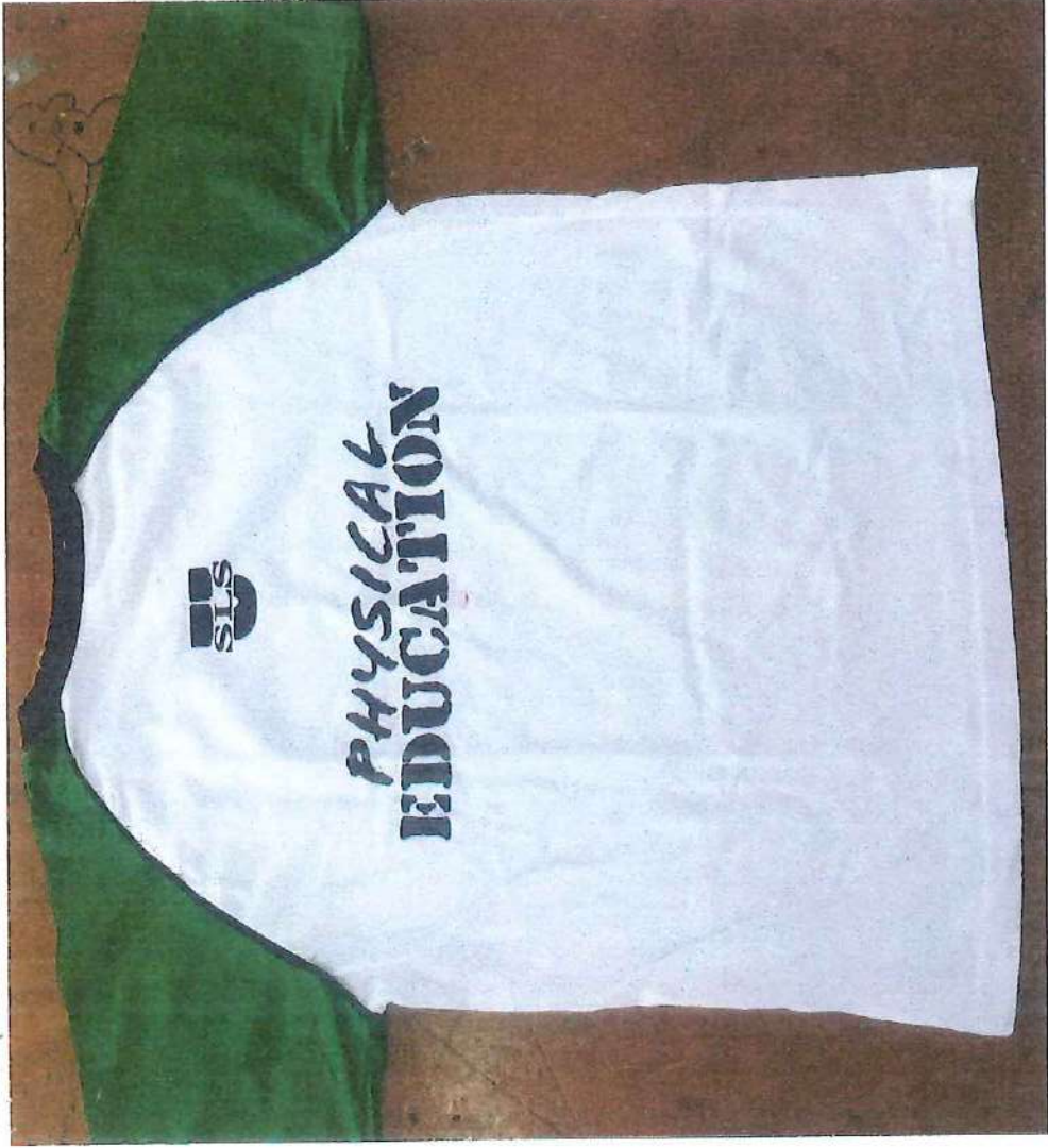
Back bodice of PE T-shirt with print of Physical Education at the back 2 ½ x 9 ½ inches. Raglan sleeves-emerald green with black piping in the sleeves. SLSU acronym at the back.